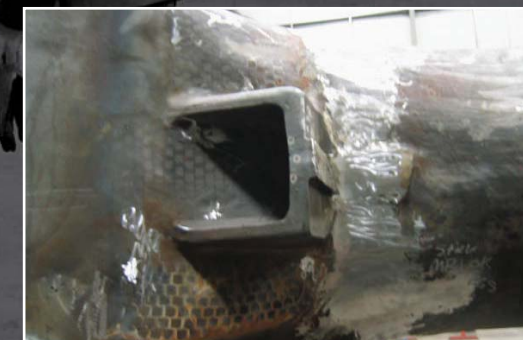
Dipper handle after repair