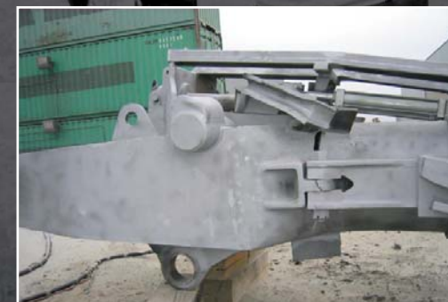
Dipper handle as received

Pictured below is a job WHI undertook last fall on a dipper handle taken off a 495 shovel. This complex repair was considered "un-repairable" by most. The component is 40 feet long and weighs approximately 24 ton. The repair was undertaken by a team of skilled welders under the direction of WHI's Doug Kalinowski.