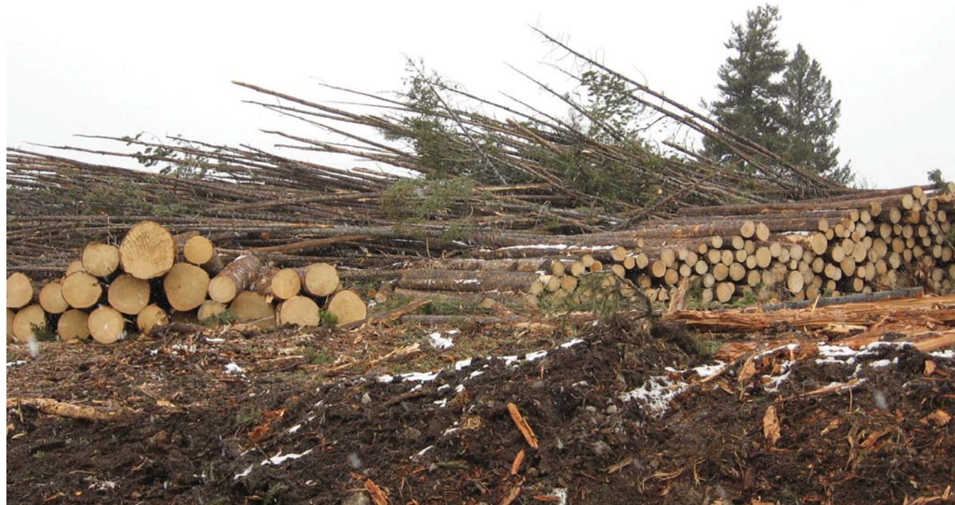
CUT TO LENGTH PROCESSED WOOD AT LANDING

All operations are aggressively ramping up and growth in the foreseeable future looks very promising. With momentum on our side, we pulled together a full cross section of people from all Weldco Companies to direct our collective focus on the future on Weldco.