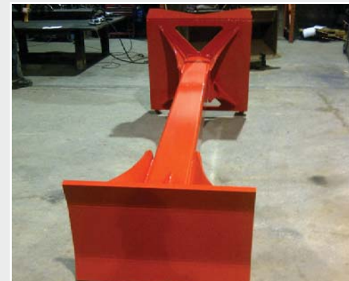
WBM Backfill Packer built for Sandvik Mining.

The Backfill Packer is used when an underground mine tunnel is being closed off and packed full of material. Underground machines with dozer style blades pack as much material as they possible into the tunnel and then the WBM Backfill Packer is used to push material into tight spaces and other areas where the dozer blade can't reach.